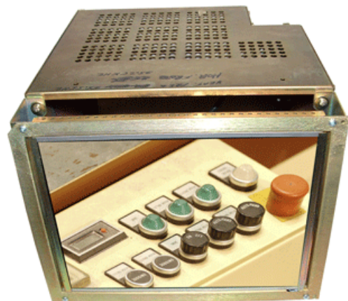
Chassis Provided by Customer