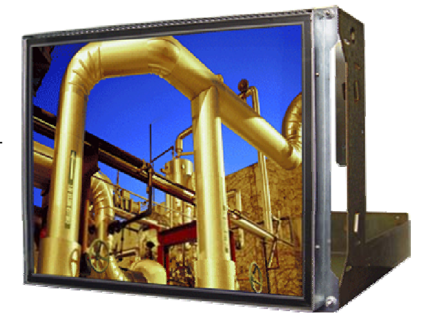
Chassis Base Provided by Customer

This 19" LCD Flat Panel unit will replace Intercolor Monitors , Conrac Monitors , Microvitec Monitors and KME Monitors .